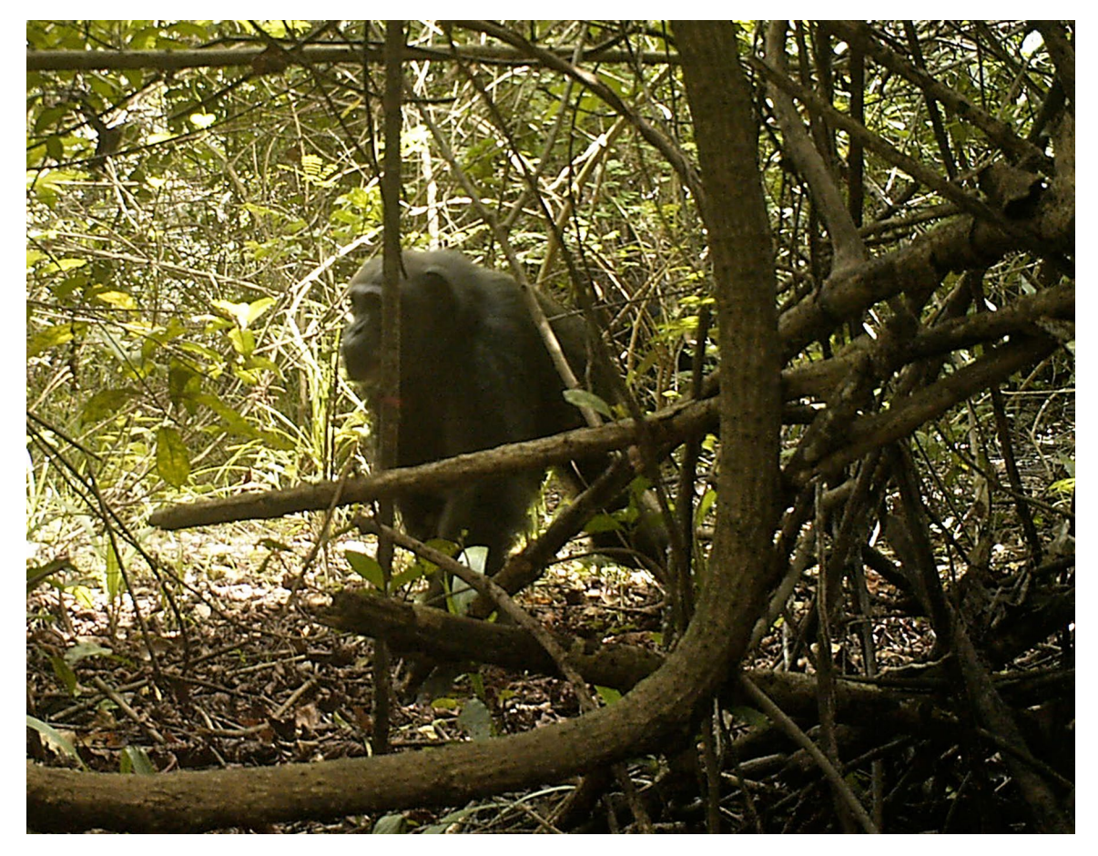
Figure 1. A chimpanzee at the Tonkolili Site.

interactions lead to a situation where chimpanzees are killed in anthropogenic landscapes, stemming predominantly from either real or perceived resource competition in a heavily fragmented landscape.