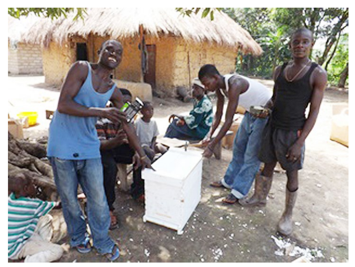
Figure 3. Newly constructed bee-keeping box at the Tonkolili Site.

was done as part of a course in "Science Serving Humanity" and provided a hands-on educational opportunity for the students. Likewise, Lynn University donated all manufacturing supplies and the shipment costs to the project. Currently, hive boxes, starter wax, protective outfits, supplementary supplies and 10 bee-keeping boxes are in Marocki and Manoni. For each village, the boxes are expected to yield an average of 150 kg of honey per semiannual harvest.